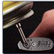
Butane to Butane Port