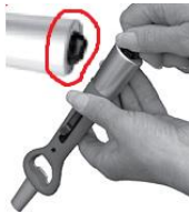
Adjust by Handle